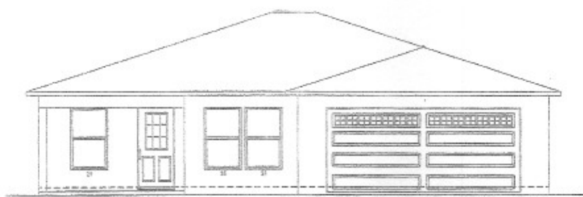
FRONT ELEVATION SCALE: 1/8"=1'-0"